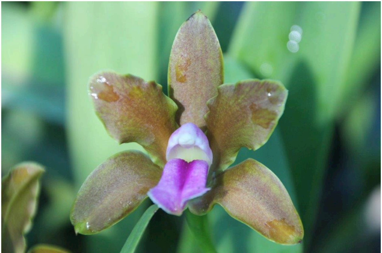
Cattleya bicolor ssp. brasiliensis , Lind. 1836